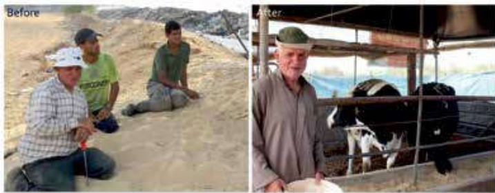
Lives of former waste pickers at the existing dump site were transformed by the provision of alternative livelihoods that took into consideration their capacities and vulnerabilities.