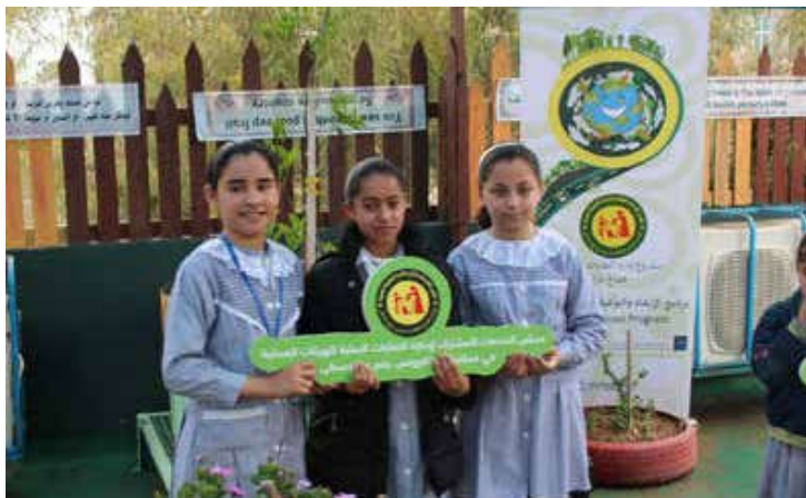
School Environmental Awareness Program, March 2018. UNRWA Middle School for Girls – Al-Nussairat Refugee Camp, Middle Area Governorate.

various interactive activities with students, such as educational sessions, environmental interactive plays, field visits to the landfills and temporary transfer stations, scientific experiments on pollution caused by solid-waste problems, and drawings and art exhibitions using recyclable materials. This program targeted 40 schools every year (18 UNRWA schools and 22 governmental schools), comprising 51,365 students from 10 to 16 years old, and 1,756 teachers. At the end of the program, 25 schools conducted recycling exhibitions inside their facilities, and 30 schools participated in an e-competition on solid-waste management. Rewards were