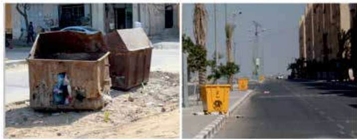
New refuse containers were provided, replacing the old and severely damaged ones.