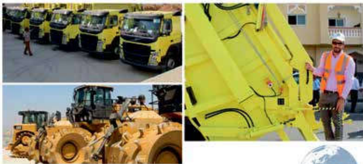
New collection trucks and heavy machinery for the new landfill's operations were provided.

In accordance with France's strong commitment to identify and mobilize sustainable environmental solutions for Mediterranean coastal ecosystems and, in collaboration with its European partners, to put an end to the humanitarian crisis in the Gaza Strip, France and the European Union – alongside the World Bank and the Palestinian Authority – were proud to inaugurate the new Al-Fukhari sanitary landfill site on June 12 in the Gaza Strip. The landfill benefits more than 700,000 persons living in the south and center of the